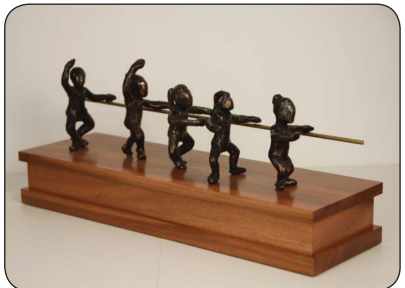
Above: At the Barre , bronze on wood, 2012

Columbus Cultural Arts Center 139 West Main Street Columbus, Ohio 43215 http://www.culturalartscenteronline.org