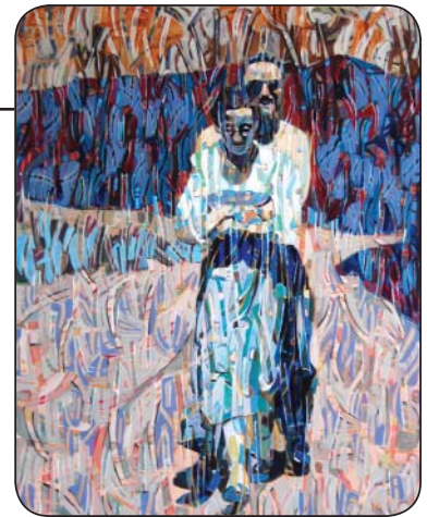
Homage to the Family