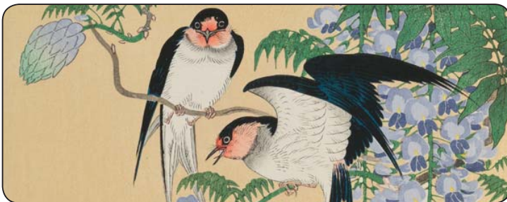
For the Birds