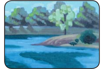
Left: Roses , oil on canvas panel, 2011. Above: Antrim Lake 9:00am , oil on canvas panel, 2010, Antrim Lake 11:00am , oil on canvas panel, 2010, by Katherine N. Crowley