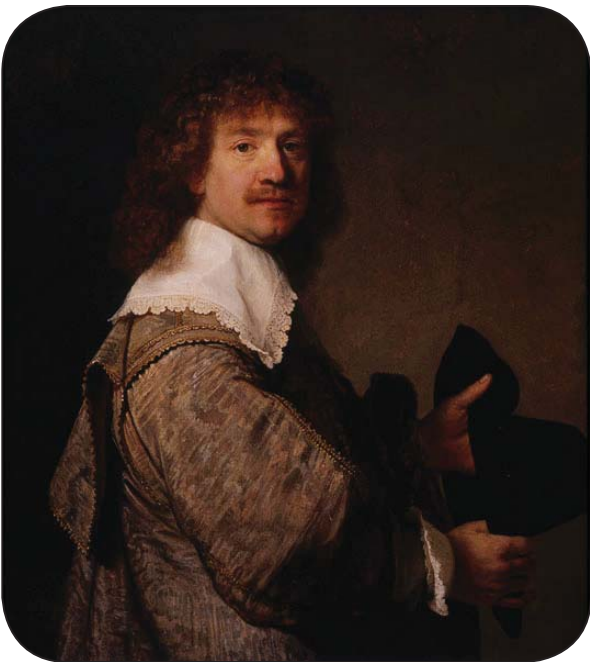
By Rembrandt van Rijn, above: Self Portrait with Beret and Turned-Up Collar , 1659, National Gallery of Art, Washington, D.C.; Portrait of a Man Holding a Black Hat , about 1639, The Armand Hammer Collection, Los Angeles.

Rembrandt in America is the first major exhibition to explore in depth the collecting history of Rembrandt paintings in America. Consisting of over 50 works, the exhibition brings together autograph works by Rembrandt as well as others thought to be by the artist when they entered American collections but whose attributions can no longer be maintained. The exhibition therefore surveys the long career of Rembrandt as a painter, including his studio and a broader network of adapters, followers, and copyists.