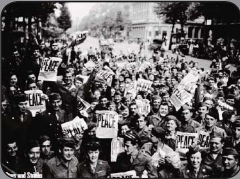
WORLD WAR II 1939-1945