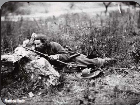
THE CIVIL WAR 1861-1865

The American Soldier: A Photographic Tribute from the Civil War to Iraq is currently on view at the Ohio Historical Center in Columbus, Ohio. This dramatic exhibition of photographs captures the essence of the American soldier over 150 years —ever since the birth of photography when the camera became a notebook to history. More than 100 enlarged photographs in the exhibition cover America in conflict during the Civil War, Spanish-American War, Boxer Rebellion, World War I, World War II, Korea, Vietnam, Gulf War, Afghanistan and the Iraq War. The American Soldier captures the danger and frustration, the humor and beauty, the camaraderie, death and victory that the American soldier has encountered throughout history.