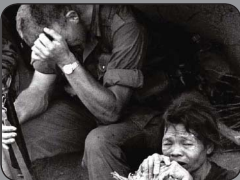
VIETNAM WAR 1965-1973

"If I am killed while carrying out this mission, I want no one to cry or mourn for me."