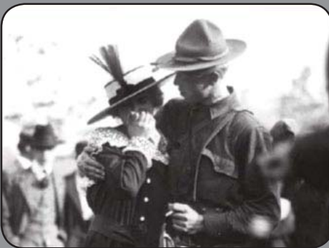
WORLD WAR I 1914-1918