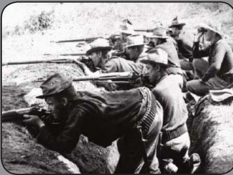
ON FOREIGN SOIL 1898-1902