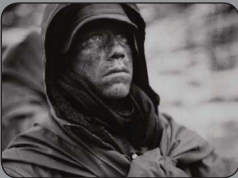
KOREAN WAR 1950-1953

"I feel terribly sorry for the refugees. They seem so miserable and all are hungry and cold. We're letting them sit by the fire and are feeding them."