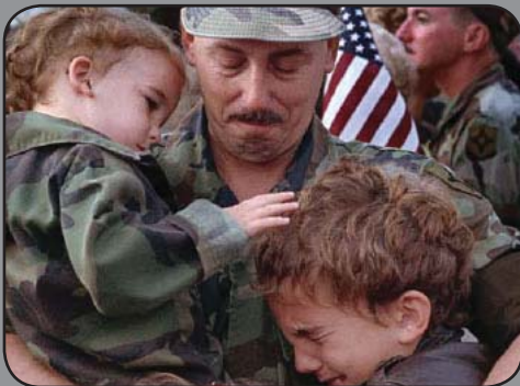
THE GULF WAR 1991