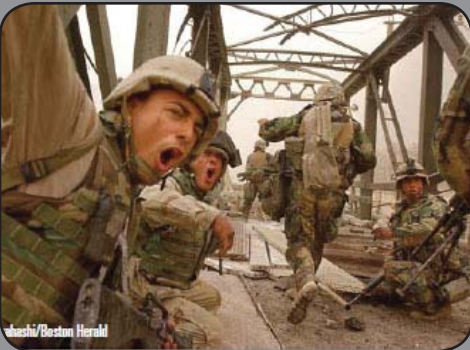
WAR IN IRAQ 2003-2010

"I can see why people that went to war don't like talking about it because it really bothers you a lot."