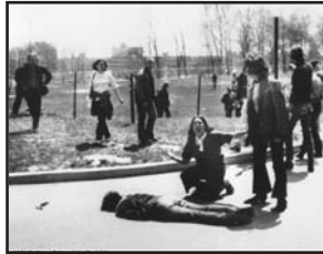
Kent State Massacre