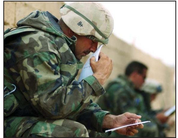
Clockwise from top left: Monrovia Under Siege