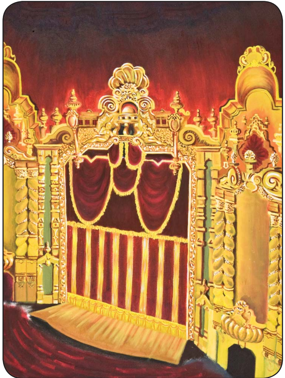
Clockwise from top left: Whetstone Park of Roses , oil on canvas, 2009; From the Mezzanine , oil on canvas, 2005 (unfinished); Sunrise, Columbus , oil on canvas panel, 2009.