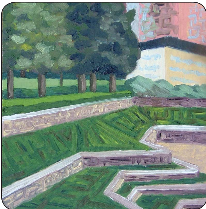
Left: The Terrance (detail) , oil on canvas panel, 2010, by Katherine N. Crowley

The High Road Gallery 12 East Stafford Avenue Worthington, Ohio 43085 http://www.highroadgallery.com