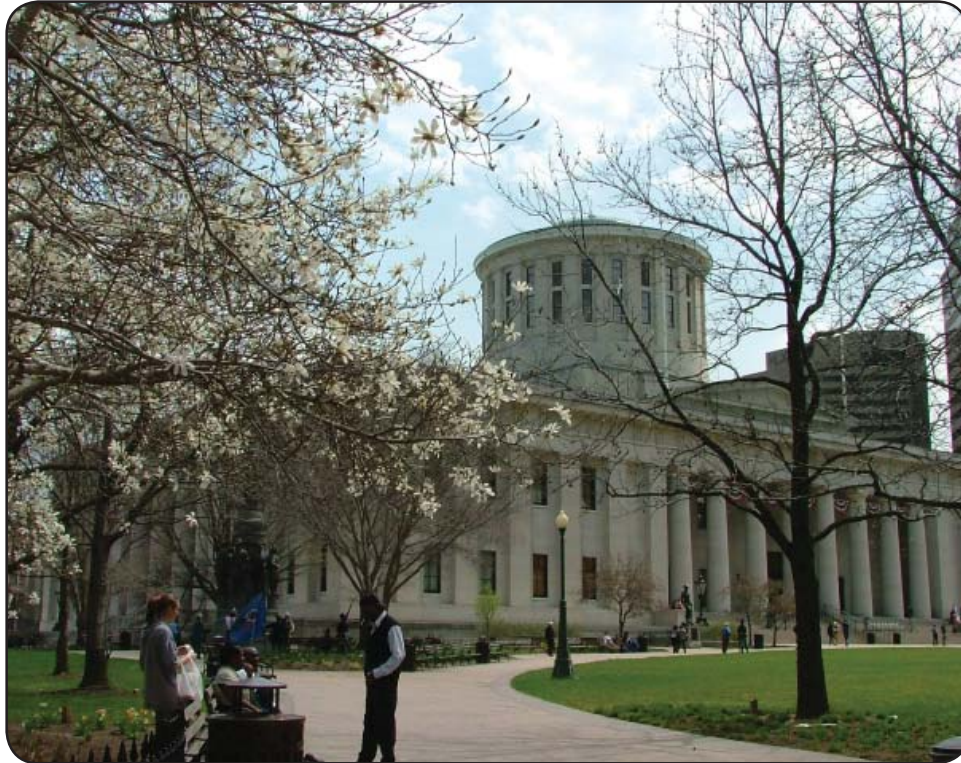
{plein air at the ohio statehouse}

MONTHLY NEWSLETTER VOLUME V No. 6 JUNE 2011