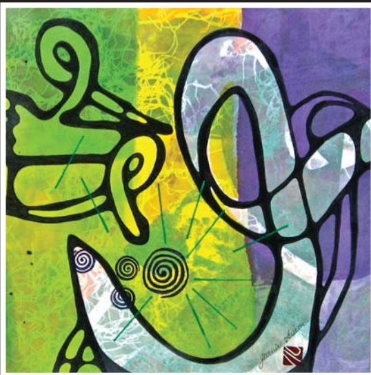
IMPROVISATION #4 by Jeanie Auseon Screen Print, Painting on Silk, 15" x 15"